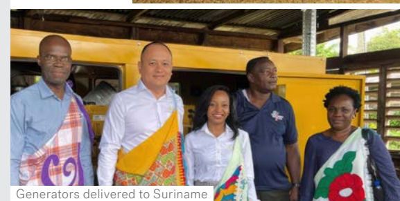
Generators delivered to Suriname

Donated generators to two remote communities in the interior of Suriname where electricity access was unavailable.