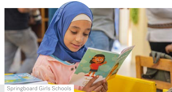
Springboard Girls Schools

homes rebuilt in partnership with the Egyptian Ministry of Petroleum and Mineral Resources in Khor Awada as part of the Aswan Relief Initiative.